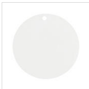
1 Blanc - White