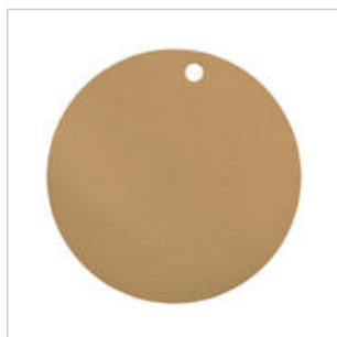
3 Or - Gold