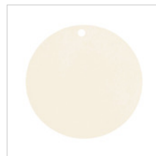
25 Ivoire - Ivory