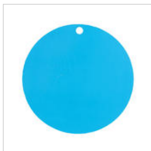
8 Turquoise - Turquoise