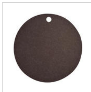
11 Noir - Black