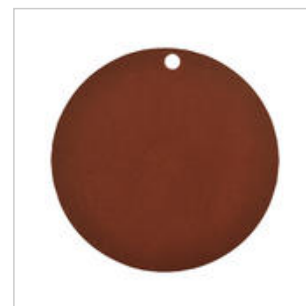
14 Chocolat - Chocolate