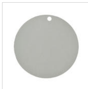
4 Gris - Grey