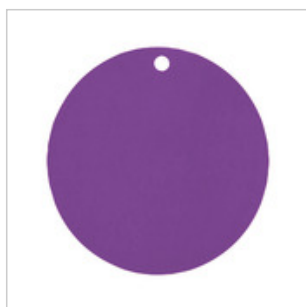
17 Prune - Plum