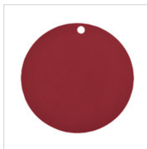
21 Bordeaux - Burgundy