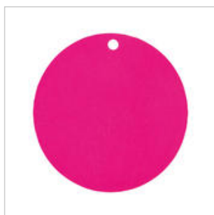
15 Fuchsia - Fuchsia